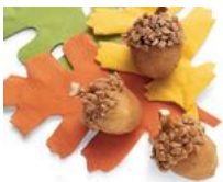
Acorn Donut Holes

Claims are not valid if current guidelines are not met.