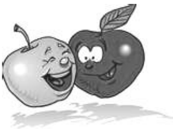
Creditable Snack: Cheese/Apple

Core and quarter an apple. Cut the wedges into cubes. Slice some cheddar or Monterey jack cheese into similarly sized cubes. Skewer the apples and cheese alternately on toothpicks, adding a raisin or blueberry for contrast between the sections.