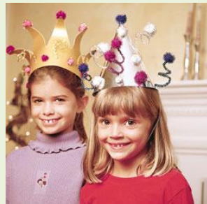
New Year Hat